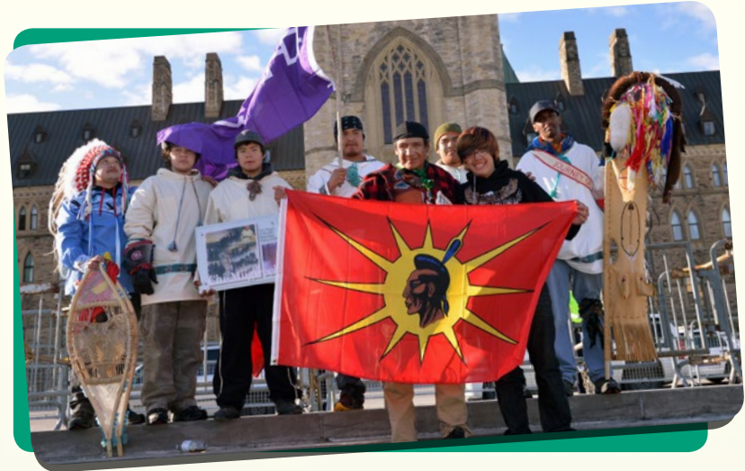
▲ The group of Cree youth that walked 1600 kilometers from their home in Whapmagoostui, Quebec to bring attention to Indigenous issues at the end of their journey on Parliament Hill in Ottawa, Ontario. Part of the Idle No More Protest.

You may enter online at our-story.ca or by mail.