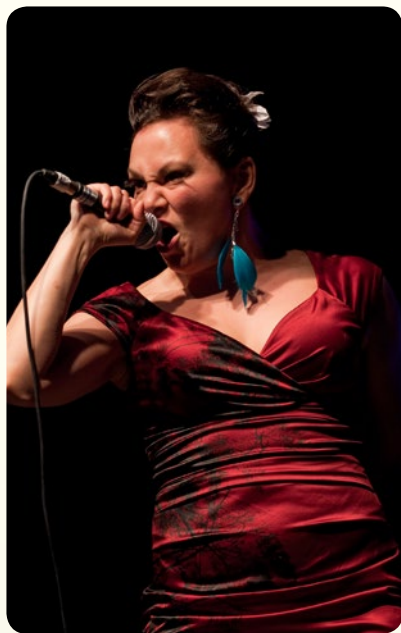
Trailblazer and award-winning Inuit Throat Singer Tanya Tagaq.

What is a trail? It might be a pathway through the forest that crosses your traditional territory. It could be a journey taken by a group of Indigenous people at some time in their history. It may be more of an idea, a path opened up by an Indigenous role model or leader for others to follow. Decide what this topic means to you and follow your own path to create an original piece of writing.