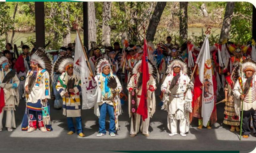
▲ Blackfoot Elders opening the traditional Indigenous Village at the Calgary Stampede in Calgary, Alberta. A Blackfoot ceremony is held daily. Photo taken on July 10, 2005.

Elders and mentors are some of the most important people in Indigenous communities. People show them respect and listen to their knowledge. Elders are often spiritual leaders and pass along lessons to younger people. Mentors are community members who show leadership skills, but may not be formally considered Elders. Anyone you look up to can be considered a mentor.