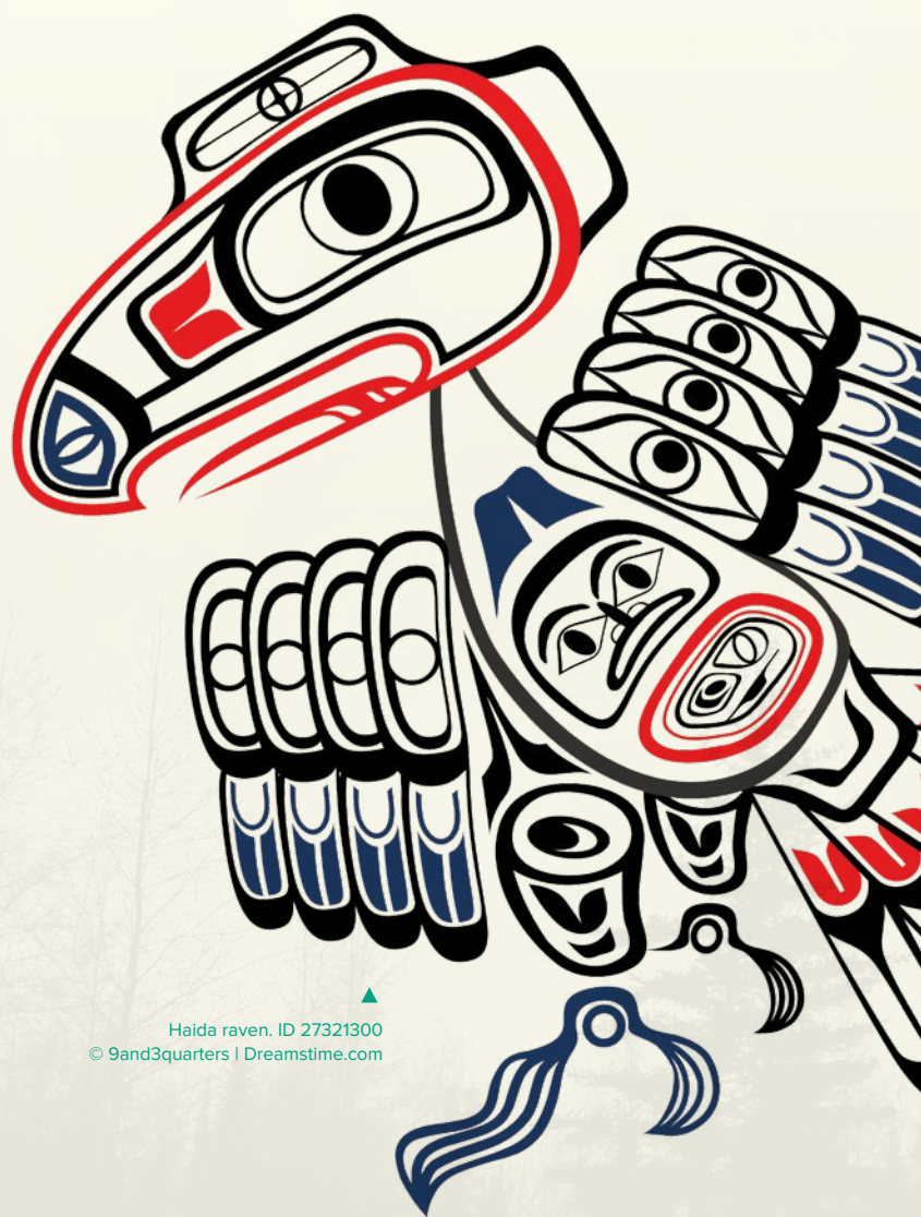
Haida raven.